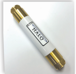
STAGE 3 HALO ION®