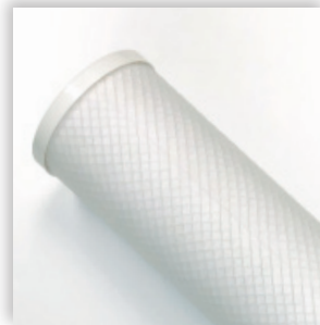
STAGE 2 ULTRA FLOW CARBON